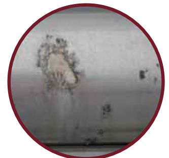
Crevice corrosion that can occur when PFMB is not used